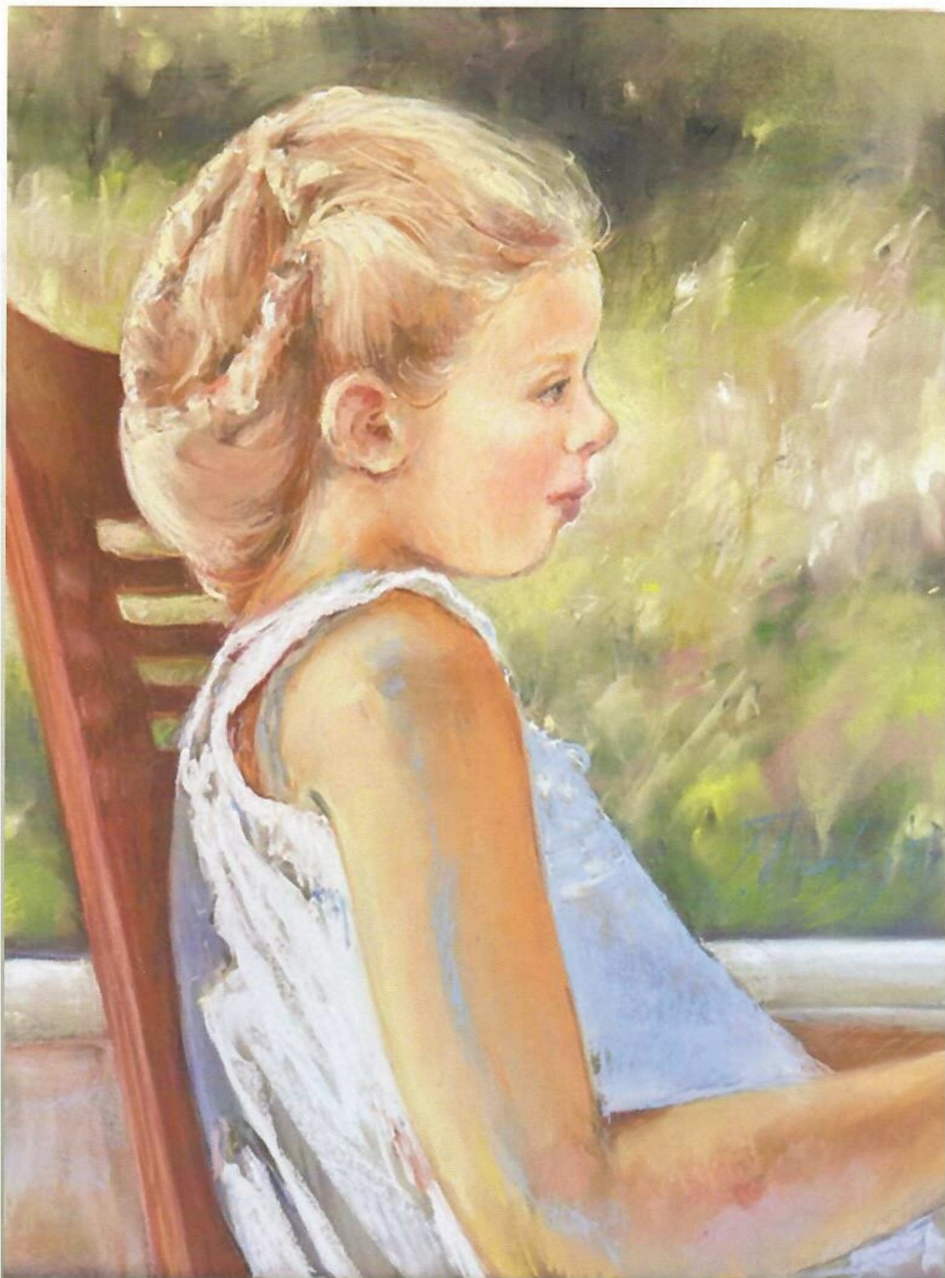
A Quiet Moment Soft pastel on pastel board 17.5" x 13.5" 2022