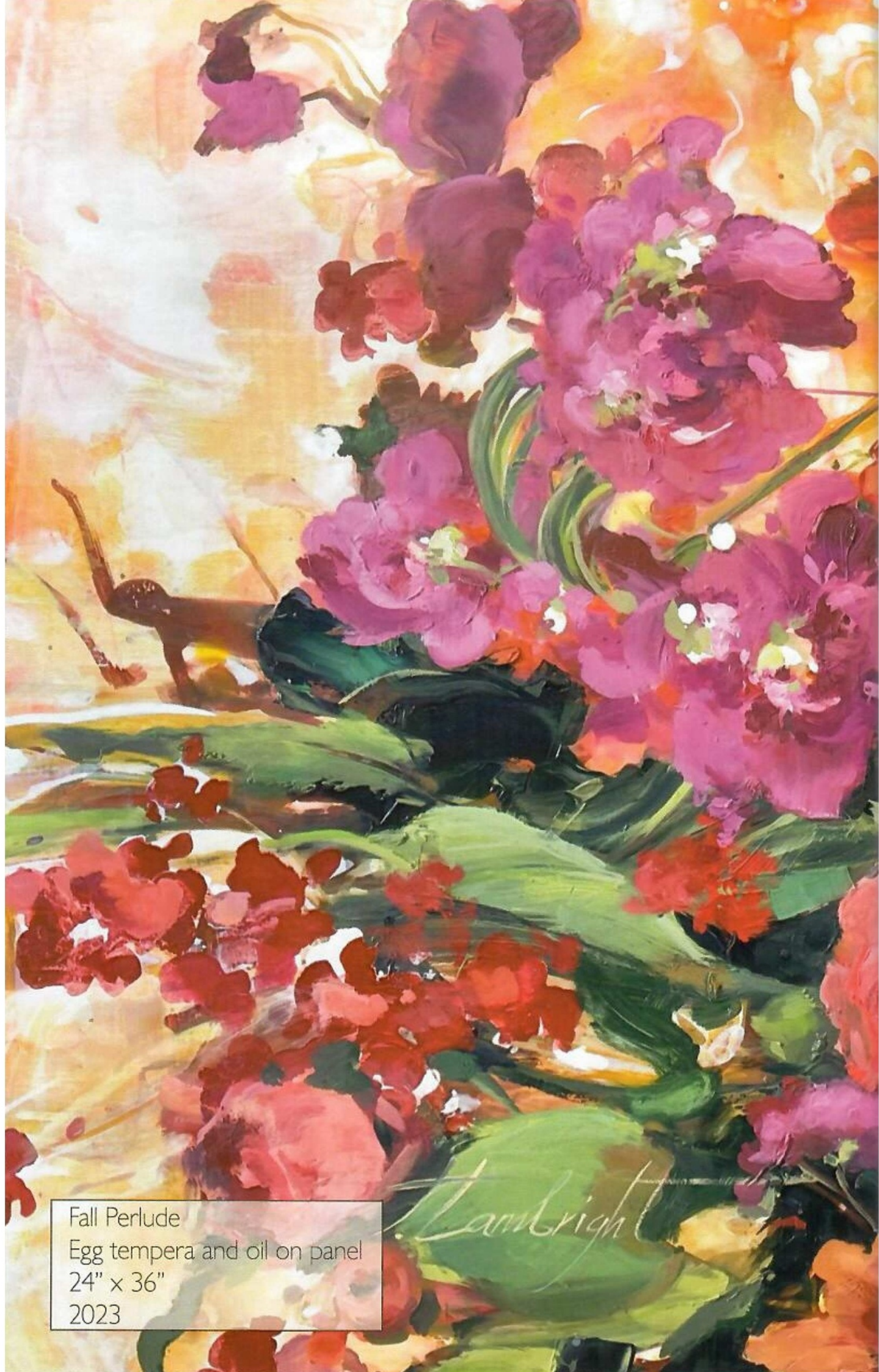
Fall Prelude Egg tempera and oil on panel 24" x 36" 2023