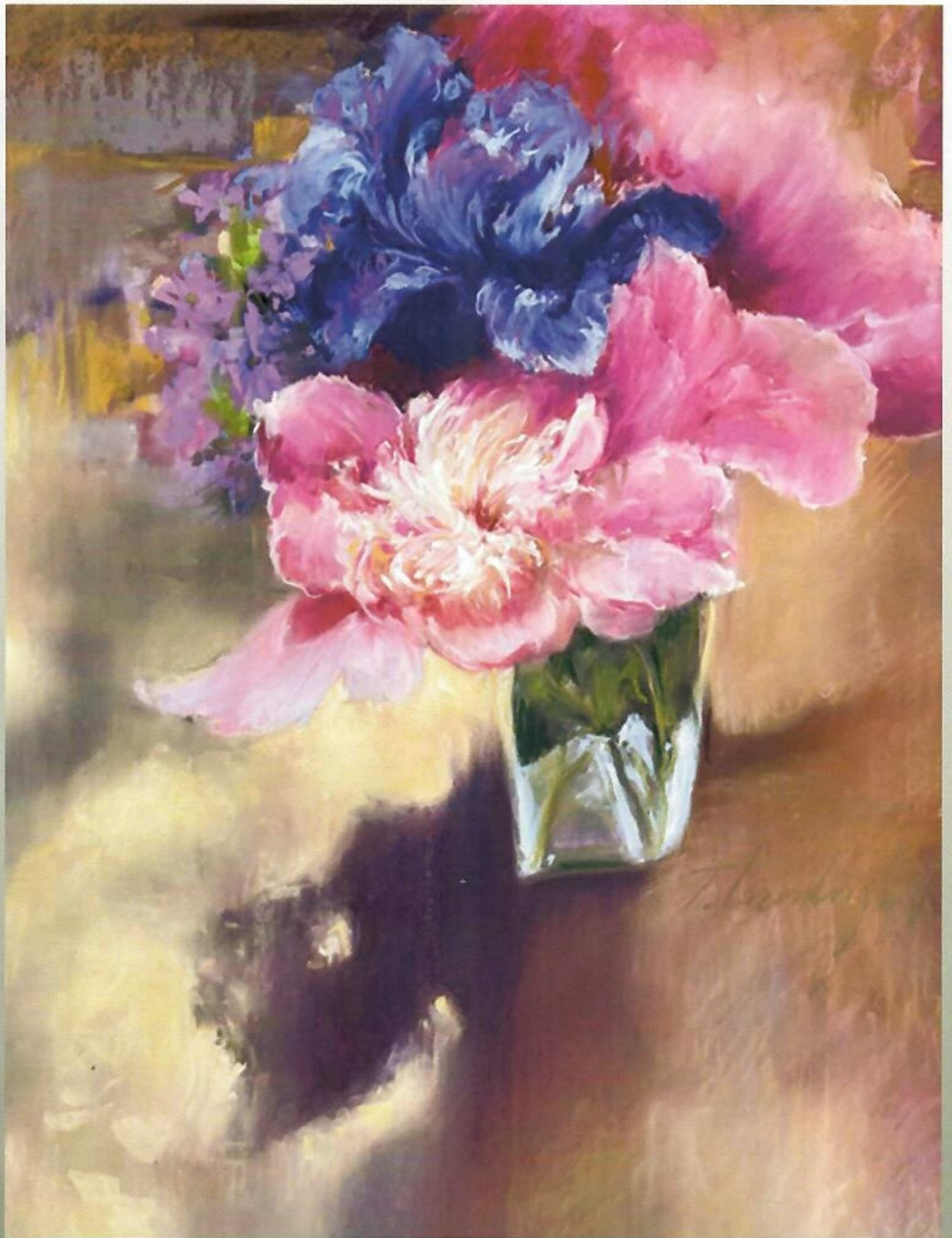
Spring Cut Soft pastel on pastemat 13" x 18" 2023