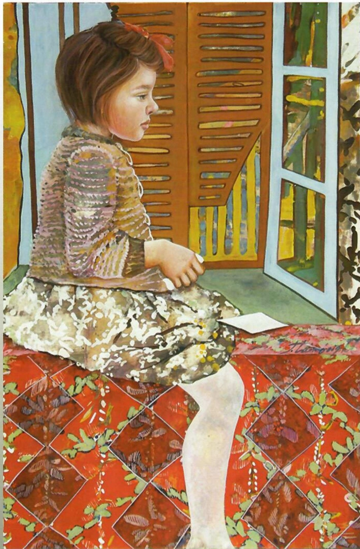
Blank Page Egg tempera on panel 30" x 20" 2020