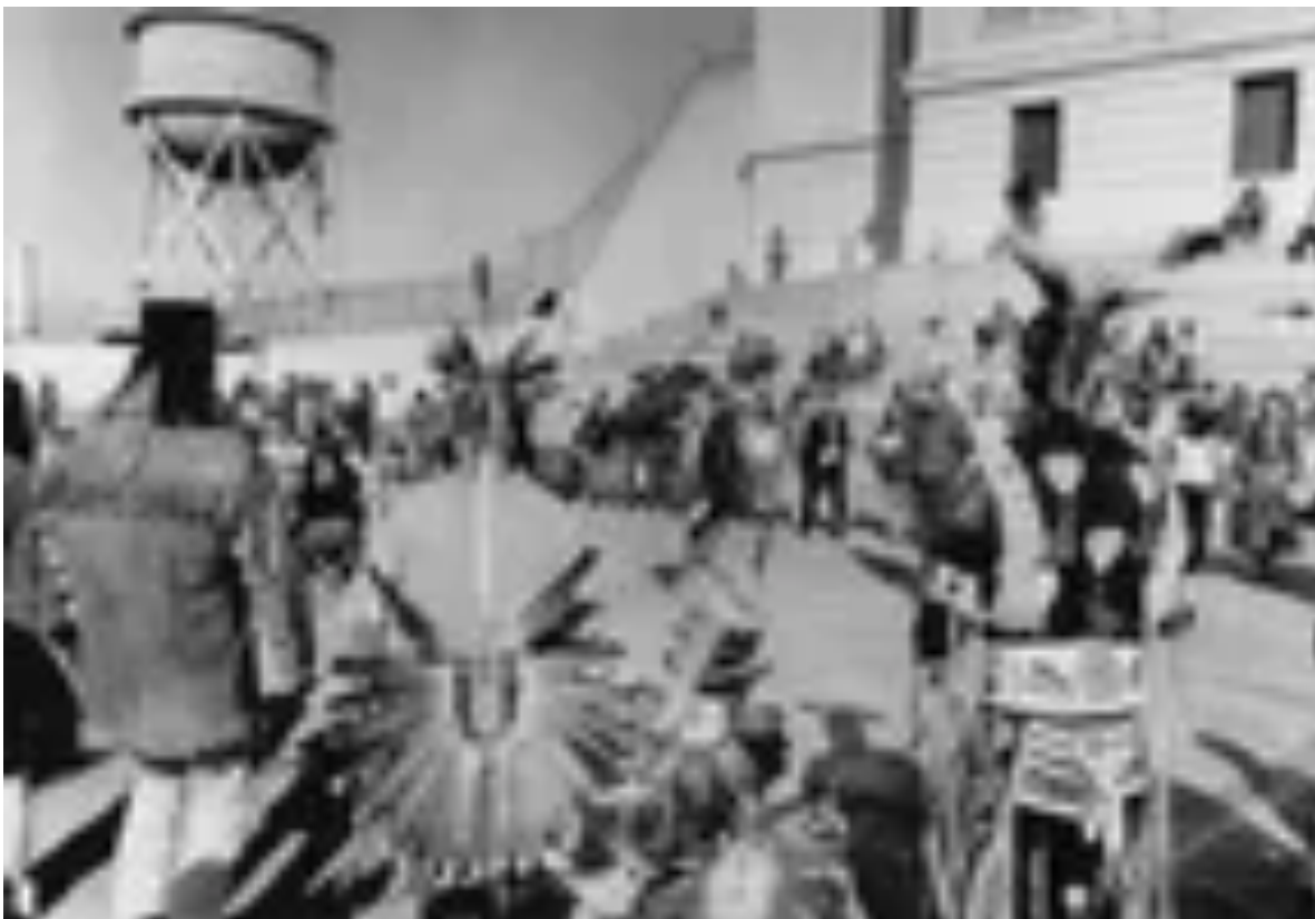
Occupants on Alcatraz Island, gather in front of the main cell block with the island's water tower ...

The occupation gradually fizzled. After 19 months, the last of the activists were removed. The action had a significant impact across Indian Country and came to be seen as the beginning of an era of Native self-determination, an era which continues.